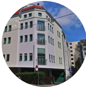
Franziskus Spital Margareten Abtlg. für Chirurgie Nikolsdorfergasse 32 A-1050 Wien, Austria