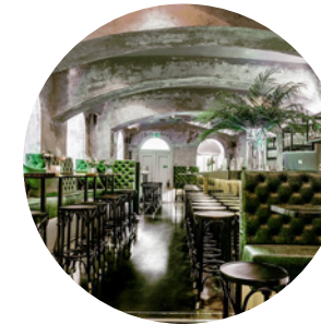
THELL Restaurant & Bar Rüdigergasse 1, Ecke Schönbrunnerstr. 30, A-1050 Wien Tel. +43 1 / 587 06 72 https://thell.restaurant.at

This event is approved with 10 DFP-points in Austria.