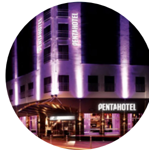
Hotel Penta Wien* Margaretenstr. 92, A-1050 Wien Tel. +43 1 / 546 86 100 https://www.pentahotels.com/de